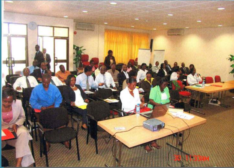
Delegates at a Michael A. Potter International Workshop